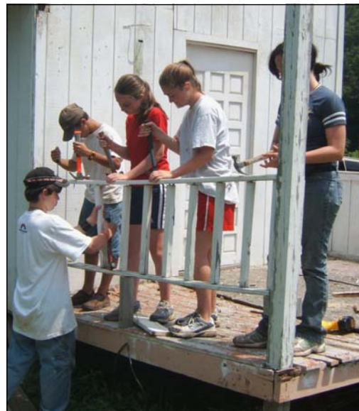
Photos from 2006 Youth Mission Trip to West Virginia