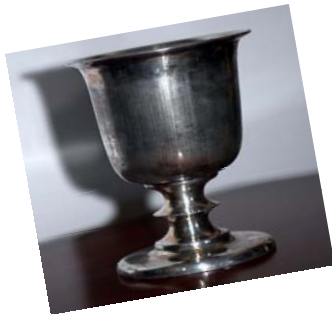
The Heritage Committee

Here are two Reed and Barton silverplate containers, one a communion chalice, the other with several possible uses. If you can remember either or both being used at the First Baptist Church of Mansfield, please tell one of the Heritage Committee members when and how it was used. Times need not be too specific, e.g. the 1940s, 1950s etc. would be close enough.