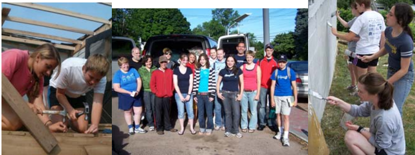
Photos from 2007 Youth Mission Trip to West Virginia

Proceeds from this public supper will benefit the Church Youth Group's Mission Trip to West Virginia this summer.